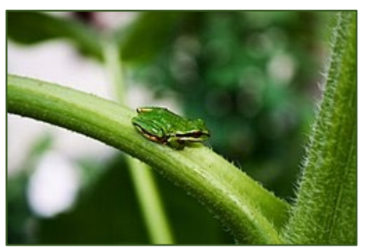
Pacific Tree Frog (Pseudacris regilla)

These tiny, secretive amphibians occupy damp or shaded woodland areas and residential yards around the community.