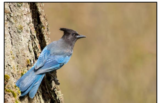
Corvids in our Backyards

Top: American Crow